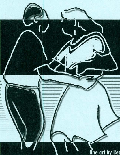
line art by Becky Hill

THE NEWSLETTER OF THE NORTH BAY COUNTRY DANCE SOCIETY